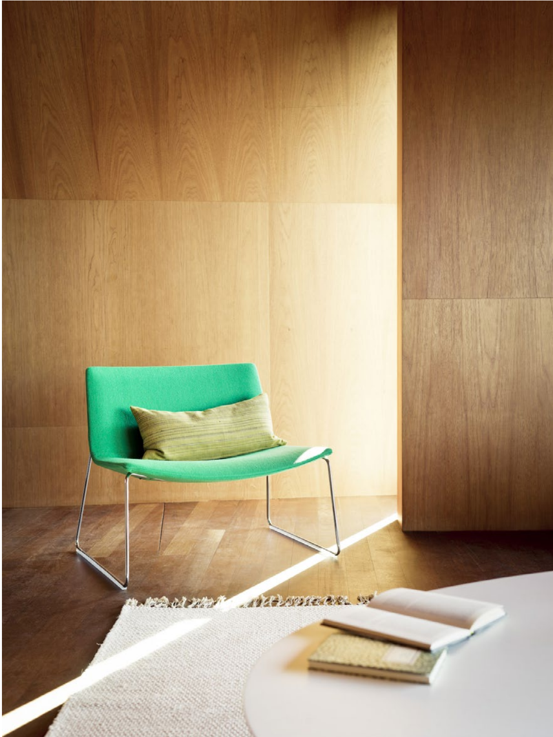
Private residence, Pontevedra, Spain Art. 2010 Chromed steel sled base & fabric upholstered shell.